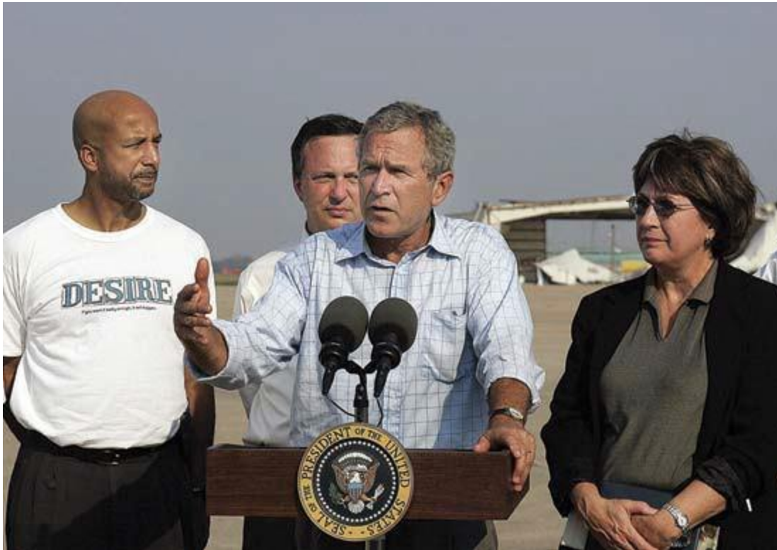
Mayor of New Orleans Ray Nagin, FEMA Director Michael Brown, President George W. Bush, and Governor of Louisiana Kathleen Blanco.

These images frame a simple narrative of what happened because of Hurricane Katrina. FEMA, and its parent organization, the Department of Homeland Security (DHS), failed. Their failure was partially remedied by the efforts of the military. There is some truth to this narrative, but it is also deceptive because it frames the response to Katrina in terms of the capacities of individual organizations. It leads us to think that solving “wicked problems” is a matter of finding the right organization. 2