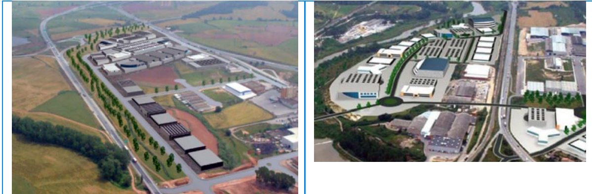
Figure: Images of “Pla” Industrial Area and the “Berga” Highway projects

In 2003, there was discussion regarding what was to prove to be PTB’s star initiative: the Central Technology Park, located next to Agulla Park and between the municipalities of Manresa and Sant-Fruitós. The project was not only intrinsically complicated, but there were also many contextual factors and interests to be taken into account. “I thought it would be very difficult for Manresa and Sant-Fruitós town halls to reach an agreement, bearing in mind that they had been squabbling for years over the restaurant in the park – who it belonged to, who should receive the property tax, and so on,” commented Lluís Piqué, spokesman for the Agulla Park Association and President of the Bages Architects Association.