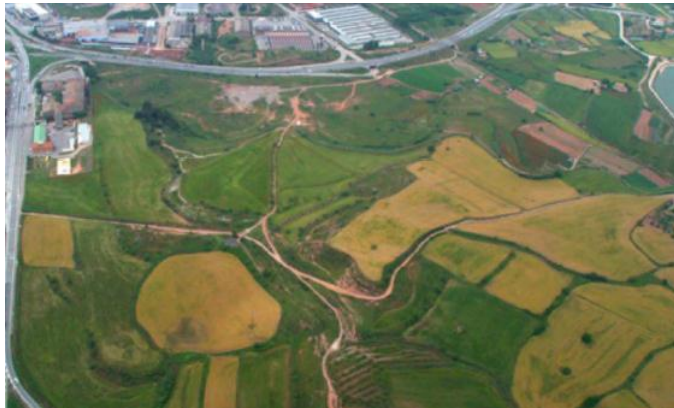
Figure: The Agulla Park