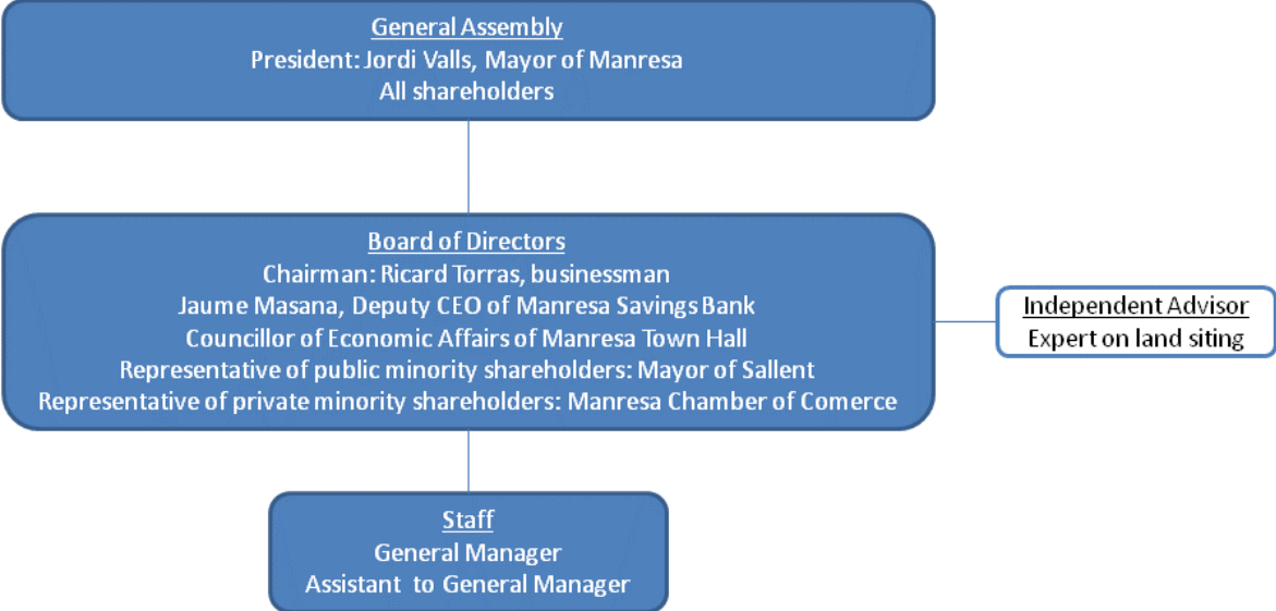
Figure: PTB’s main players

“Of course, they [the businessmen] don’t see it that way; they interpret it as the public administration strewing their path with obstacles. They don’t realize that it’s better for everyone if the public administration plays hard but fair.”