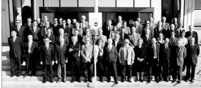
El associats de l'holding territorial. Davant l'edifici del centre operatiu de Caixa Manresa, on s'ha de desenvolupar l'acte de constitució de Projectes Territorials del Bages SA.

La nova societat promotora del territori neix amb un ampli suport d'institucions i empreses